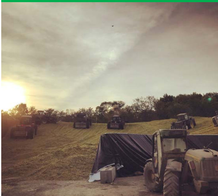
It takes a TEAM...packing the bunk as the sun sets at Vorsteveld Farm—Corn Harvest 2017. Sept. 21 2017

Contact us at info@champlainvalleyfarmercoalition.com or (802) 388-4969 ext 348